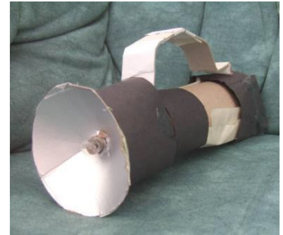
A torch made using simple components