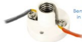
Bulb holder – Bend wire around screw in direction of turning when tightening