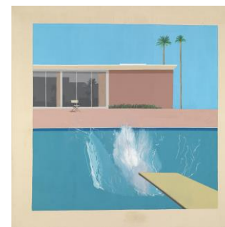
Hockney, A Bigger Splash, (1967)