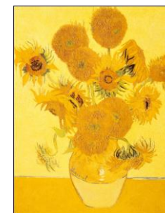
Van Gogh, Sunflowers, (1888)