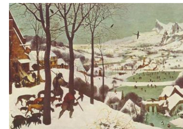
Bruegel, Hunters in the Snow, (1565)