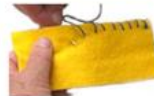
Over sew stitch