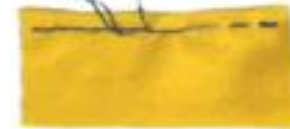
Backwards running stitch